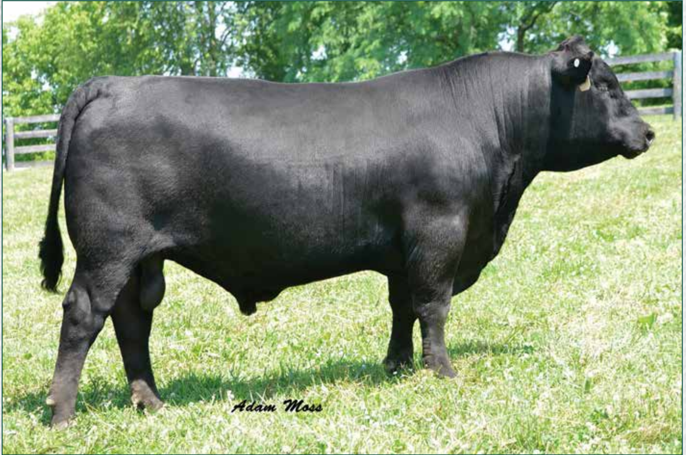
XAG Full Count / Reference Sire A