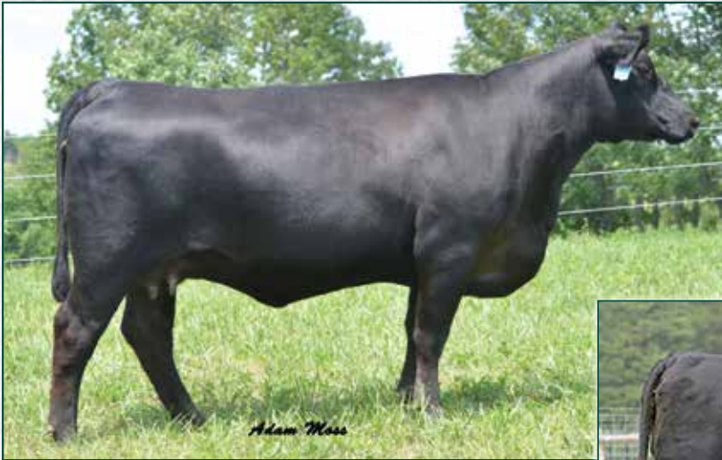
Decades Primrose B47 / Daughters of this prolific Blue Lake donor sell as Lots 16A through 16C.