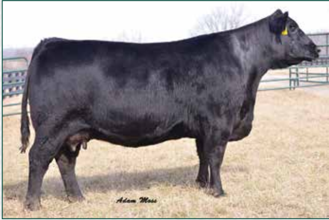
BoBo Blackcap 532U / The $124,000 valued grandam of Lot 29.