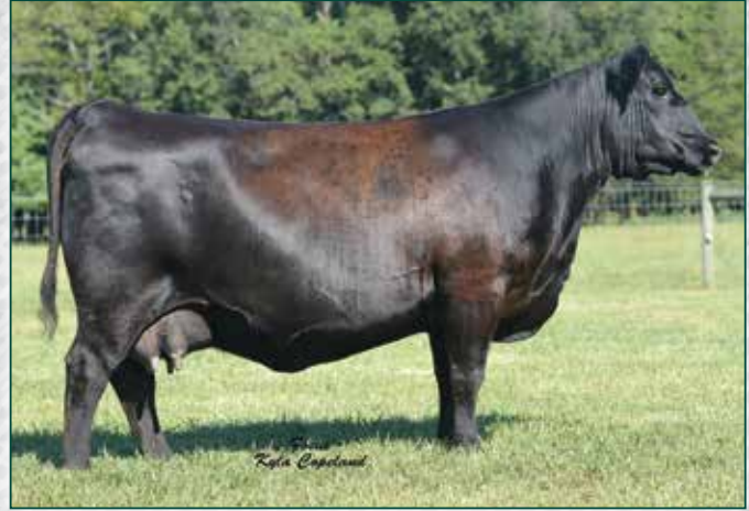
FFF/LLF Blackcap 901 / The cornerstone third dam of Lot 36.

Owned by Black Gold Genetics, Robinson, IL • Miss Confidence 5492 is a low-birth daughter of the Louiso Farms sire, Confidence 2092 and was produced by a first calf heifer sired by Design 762. • Has a 6/6/18 bull calf, Lot 34A, by VAR Generation 5224. • Open and ready to breed.