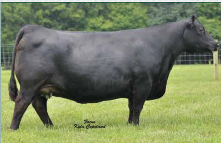
Rudow's Homer Molly 073 / The $20,000 donor dam of Lot 10.