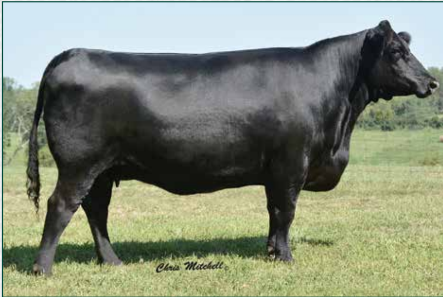
JLM Lucy W333 / Dam of Lot 9.