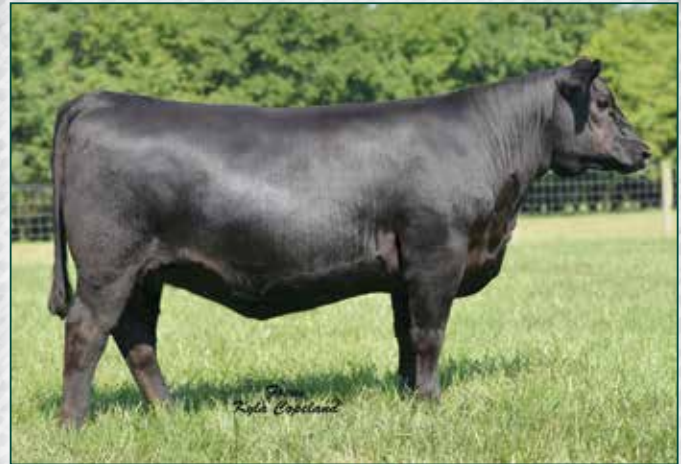
Decades Donna P24 / The foundation Blue Lake Donna and donor dam of Lots 20A through 21C.