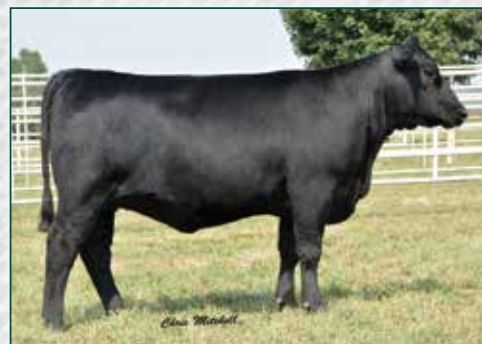
Deer Valley Blackcap 5824 / Daughters sell as Lots 1 and 1A.