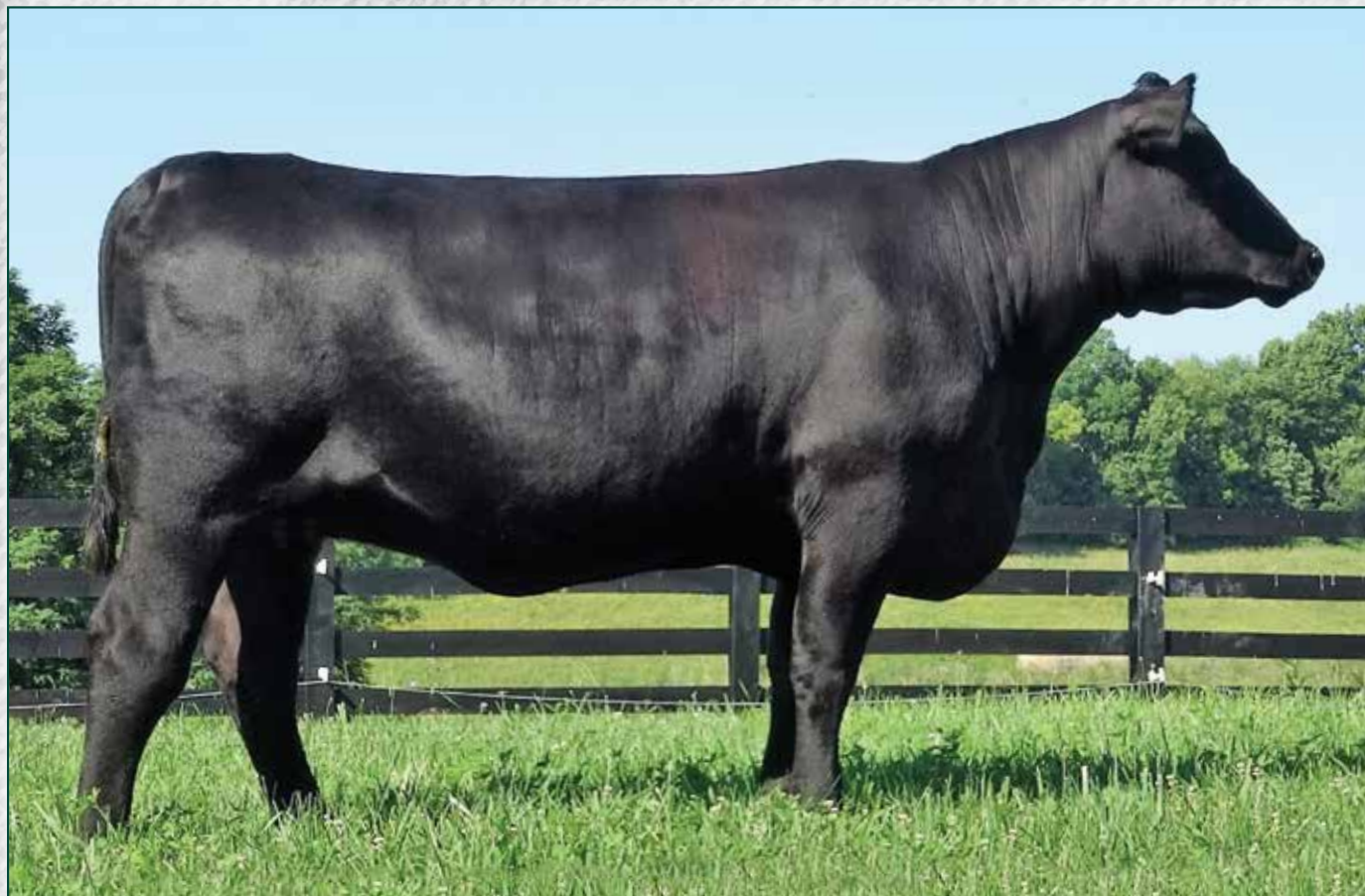
Blue Lake Rita 2820 / The $130,000 valued donor dam of Lots 4A and 4B.