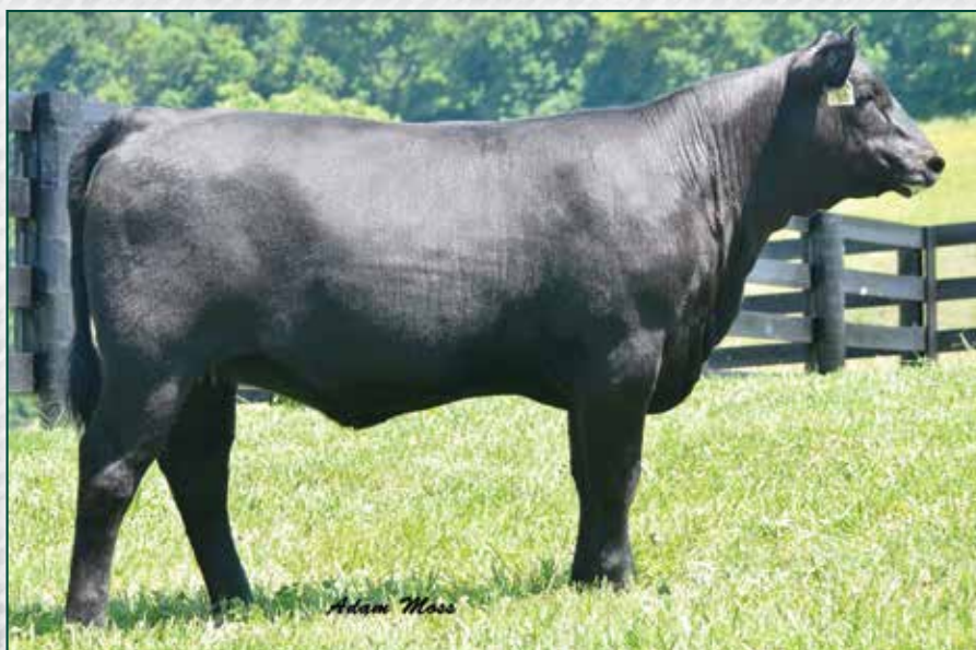
Blue Lake Blackcap 3285 / Lot 2A