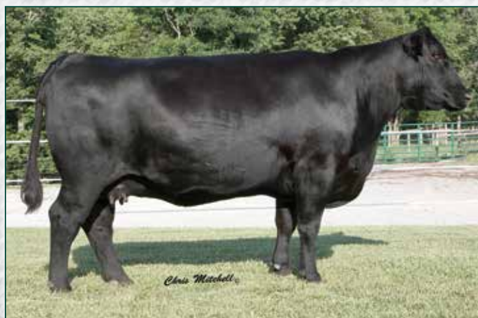
Maplecrest ForeverLady F8186 / A daughter sells as Lot 18.