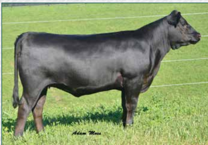
Blue Lake Donna 2608 / Lot 21C

Owned by Blue Lake Cattle Ranch, Lexington, KY