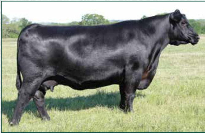
VAR Lucy 8334 / A daughter sells as Lot 7.