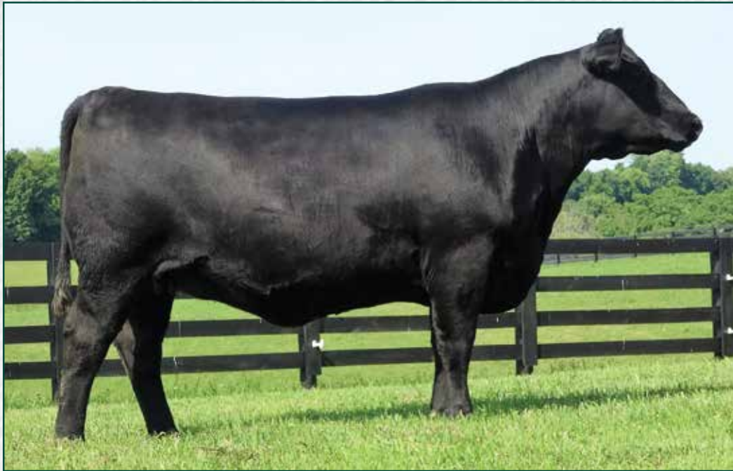
Blue Lake Fanny 3642 / Lot 40

OFFERING HALF INTEREST IN FANNY 3642, A DIRECT DAUGHTER OF THE $120,000 VALUED ANCHOR OF THE CRAZY K RANCH AND FAIRWAY ANGUS JOINT DONOR PROGRAMS Sired BY THE LOW-BIRTH AND CARCASS SIRE JOURNEY.