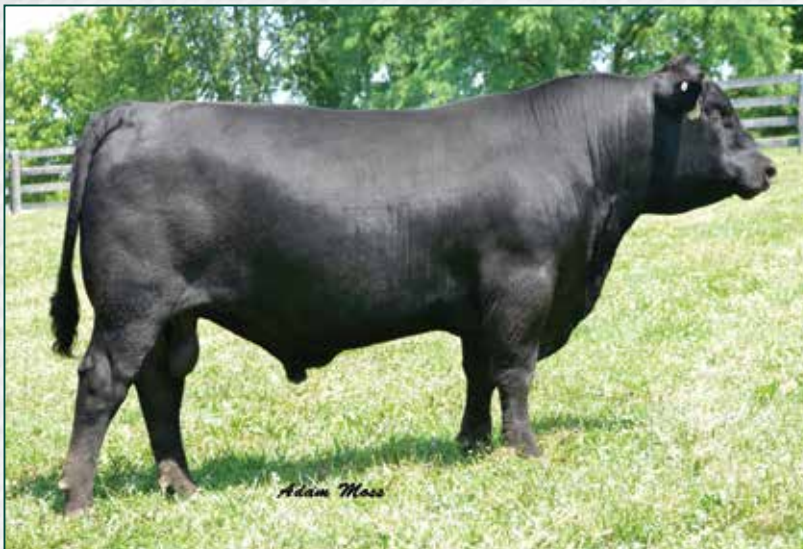
XAG Full Count / A maternal sister to this $B breed leader sells as Lot 3.

Selling half interest with the option to double the purchase price and own full interest.