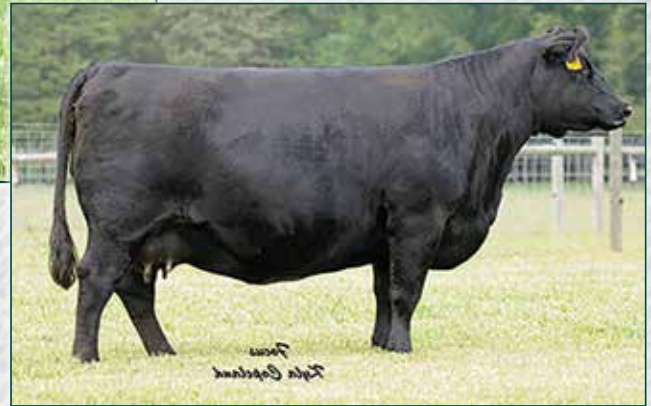
Stoney Fork Primrose7111 / The dam of Lot 17, and grandam of Lots 16A, 16B, and 16C.