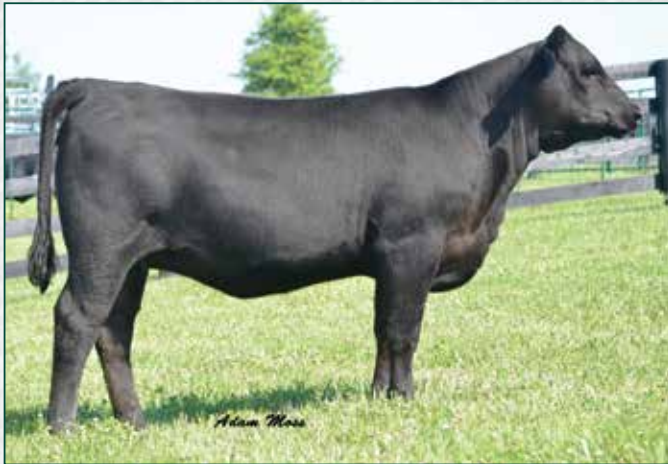
Blue Lake Donna 3120 / Lot 20A