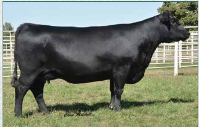
Deer Valley Henrietta 1614 / A granddaughter of this second-generation Deer Valley Farm donor sells as Lot 30.

Owned by Black Gold Genetics, Robinson, IL