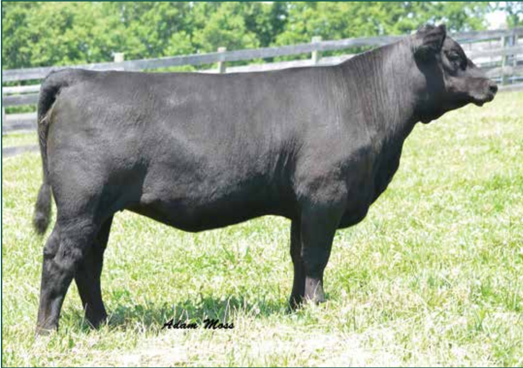
XAG Blackcap 1715 of 0413 / Lot 3