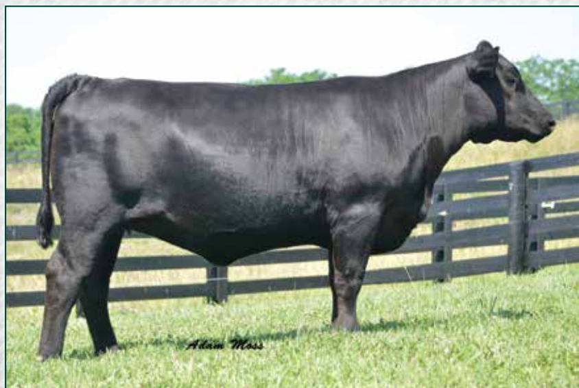
Blue Lake Ruby 3300 / Lot 39

• Ruby 3300 is a calving-ease and RE daughter of the growth, RE and $B sire in the ABS roster, Rampage and she stems from a dam who blends Ten X and Foresight with the Pathfinder Dam, Ruby 3063. • The dam of Lot 39 posts a WR 1@100 and a YR 1@100. • Due 3/1/19 to Jindra Acclaim.