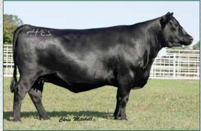
GAR Objective 2345 / Descendants of this $300,000 CED leader sell as Lots 23 through 24A.