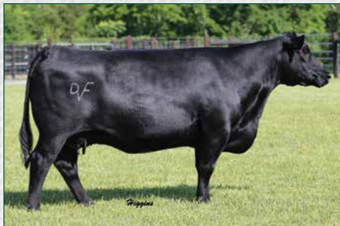
Deer Valley Henrietta 2912 / The 45,000 dam of Lot 15 featured in the Ankony Angus program.

• Due 4/16/19 to Bubs Southern Charm AA31.