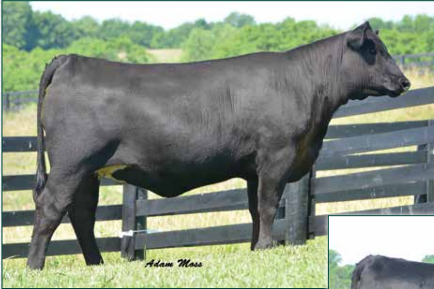
BLC/FFF/FPF Blackcap 3912 / Lot 2B