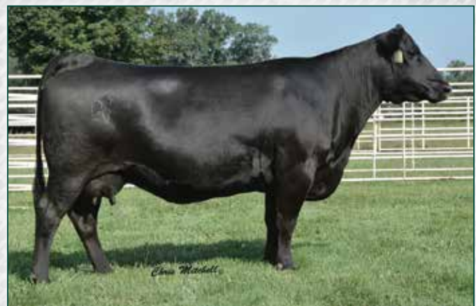
Deer Valley Rita 1126 / The $100,000 valued donor dam of Lot 5.

Selling a full sister to the popular Deer Valley Old Hickory