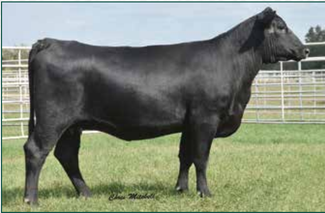
Deer Valley Rita 3759 / A daughter sells as Lot 23.