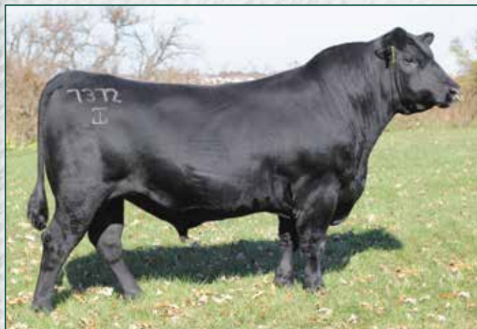
GAR Momentum / A daughter of this breed Marb. leader sells as Lot 37.