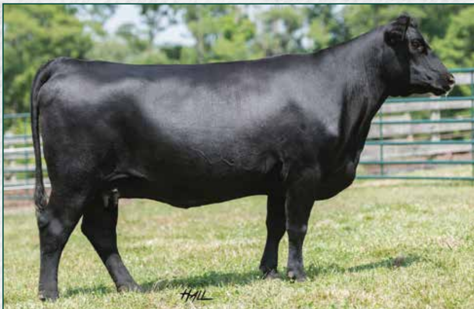
Maplecrest ForeverLady V3089 / Lot 18