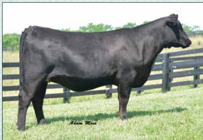
Blue Lake Primrose 3115 / Lot 16A

• Due 3/1/19 to Stevenson Big League 70749.