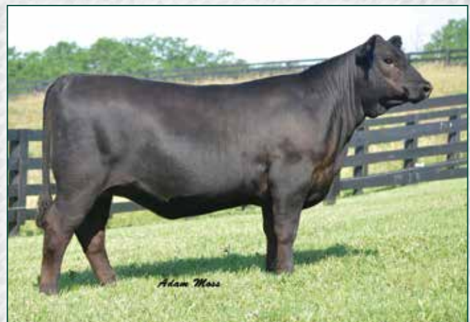
Blue Lake Donna 3112 / Lot 20B

Owned by Blue Lake Cattle Ranch, Lexington, KY