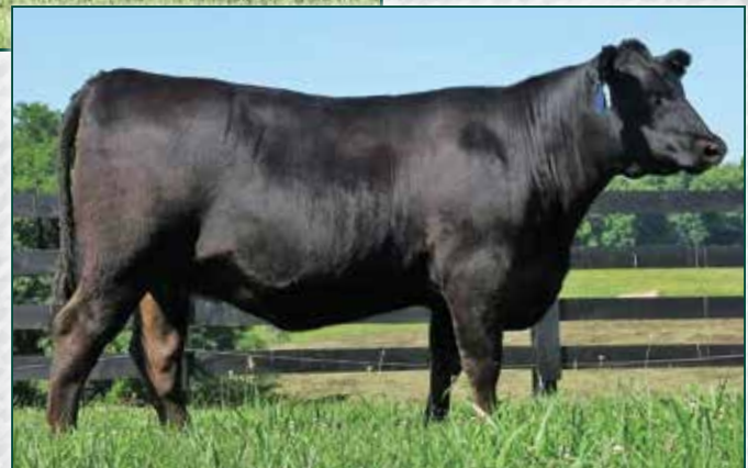
Blue Lake Rita 3444 / Lot 5