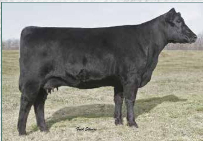
Daltons Rita4296ofHP1200 MF / A granddaughter sells as Lot 32.