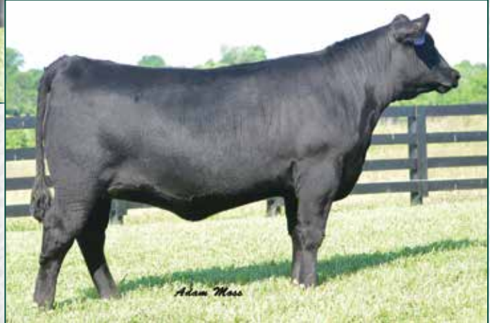
BLC/FPF Blackcap 3590 / Lot 2C