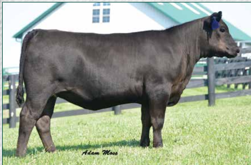
Blue Lake Blackcap 3571 / Lot 1A