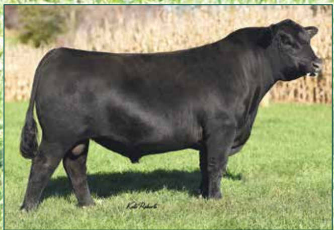
ACC Bourbon 0115 / A full sister to this $50,000 Select Sires roster member sells as Lot 6.