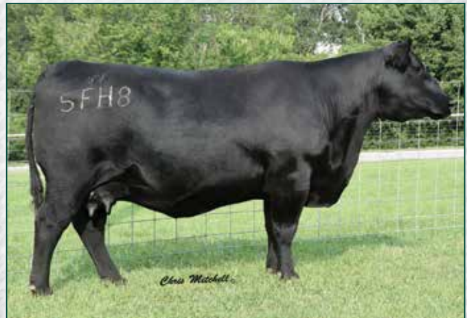
Rita 5FH8 of Rita 2V5 FD / A granddaughter of this foundation Jac's Ranch donor sells as Lot 35.

Top 3% $G Top 10% Marb Top 25% REA Top 25% $B