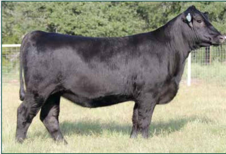
DCF Lucy 5735 / A full sister to this Pollard Farms female sells as Lot 8.